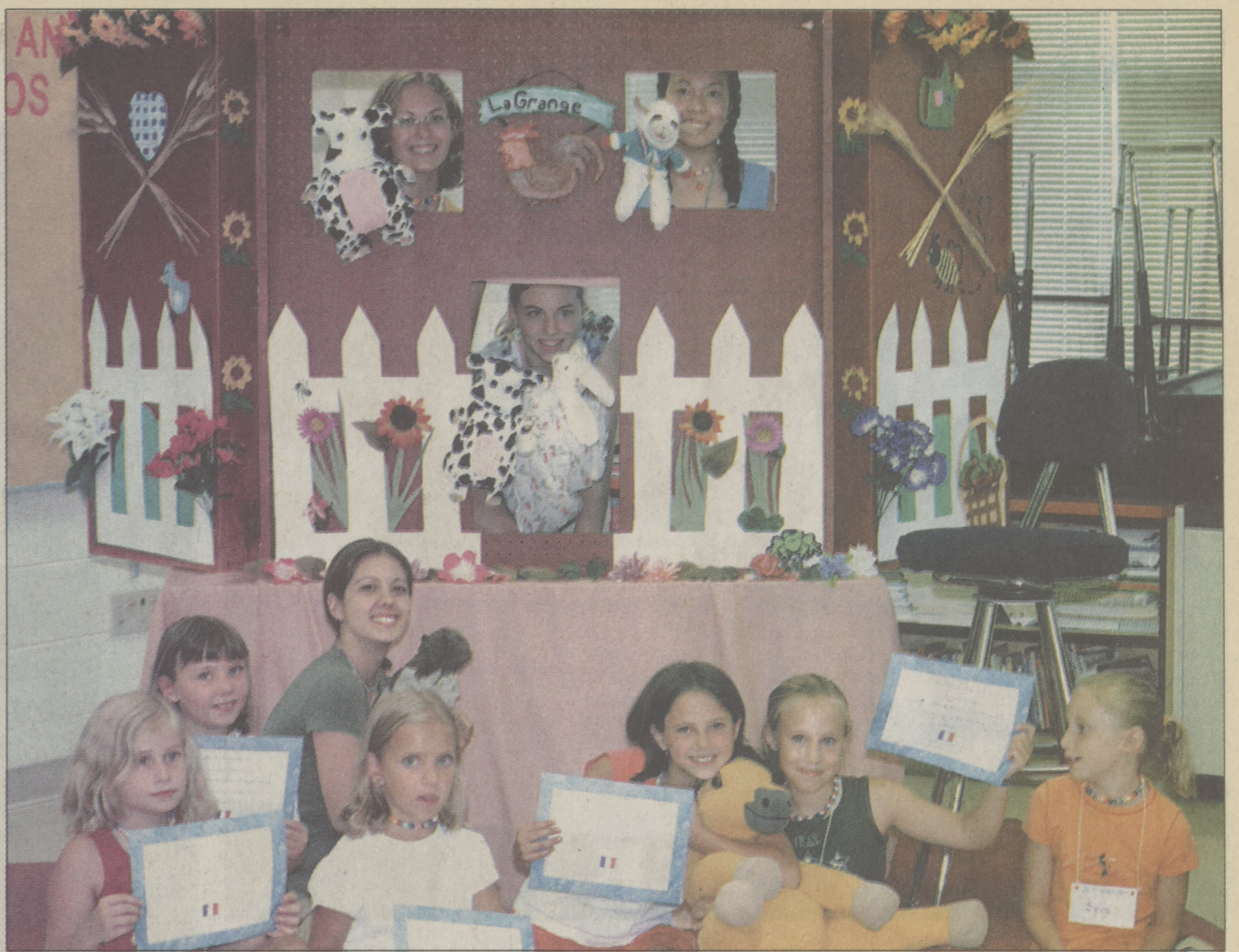
Counselors put on a puppet show to help children learn French.

"This is not only a way to add more culture to their lives, but also a way to improve their understanding of another language."