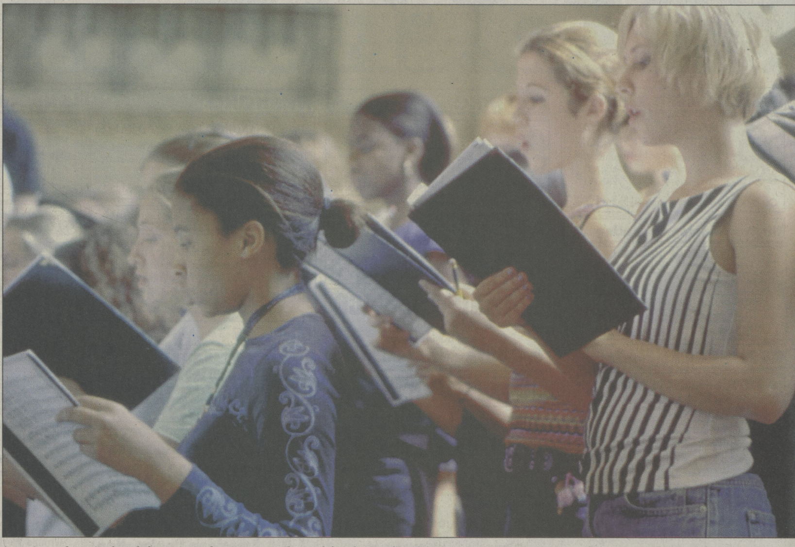
A variety of musical and theater productions are planned for the Performing Arts Institute at Wyoming Seminary's Upper School.

Summer is the time when residents of the Orchestras and Choral Ensembles will per-Wyoming Valley can delight in hearing teachers, guest artists and students perform in a diverse concert series for the public. It's all part of a busy season of the Performing Arts Institute (PAI) at Wyoming Seminary Upper School, which will present a series of free, high quality performances in July and August.