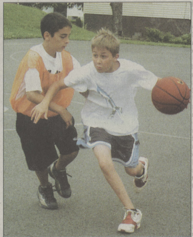
Play started last week in the Dallas Boys Summer Basketball League.