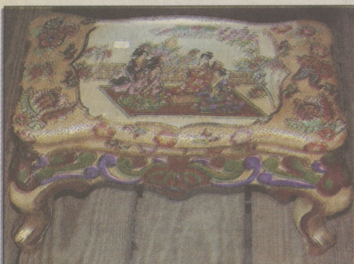
This beautiful stool is just one of hundreds of antique items that will be sold over the block.