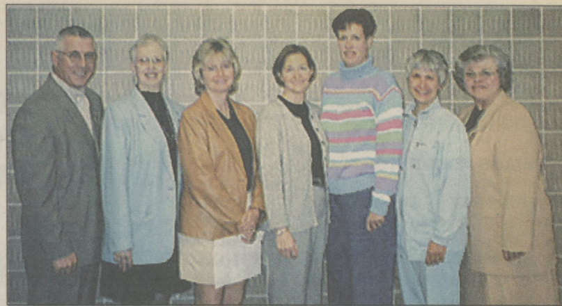
Student of Month breakfast