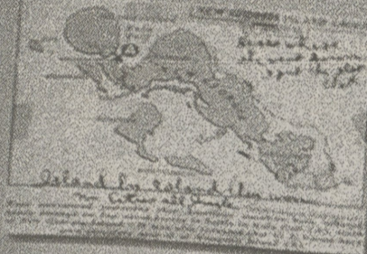
This map shows where Eugene Markoski's ship, the USS Brown, was sunk during battle with the Japanese in the Solomons Islands in 1943. The ship was sunk on October 27, 1943.