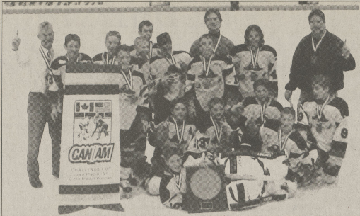
The Pocono Pirates Pee Wee "A" team with their gold medal trophy and banner, on the ice at Lake Placid.