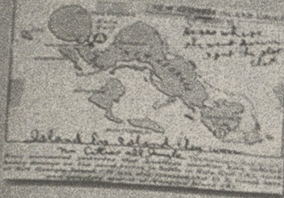
This map shows where Eugene Markoski's ship, the USS Strong, was sunk during battle with the Japanese in the Solomon Islands in 1943. The ship was one of the many that were sunk in the Pacific during the war.