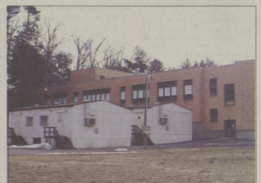
Two modular buildings outside the former Westmoreland school will have to be removed under terms of a zoning variance.

"The whole reason I am interested in this property is its loca-