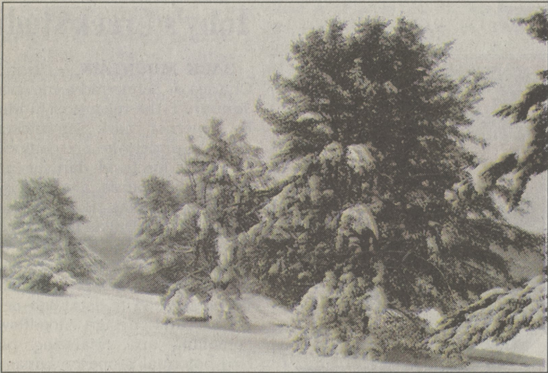
Snow covered trees made for a pretty picture off Manor Drive in Shavertown.