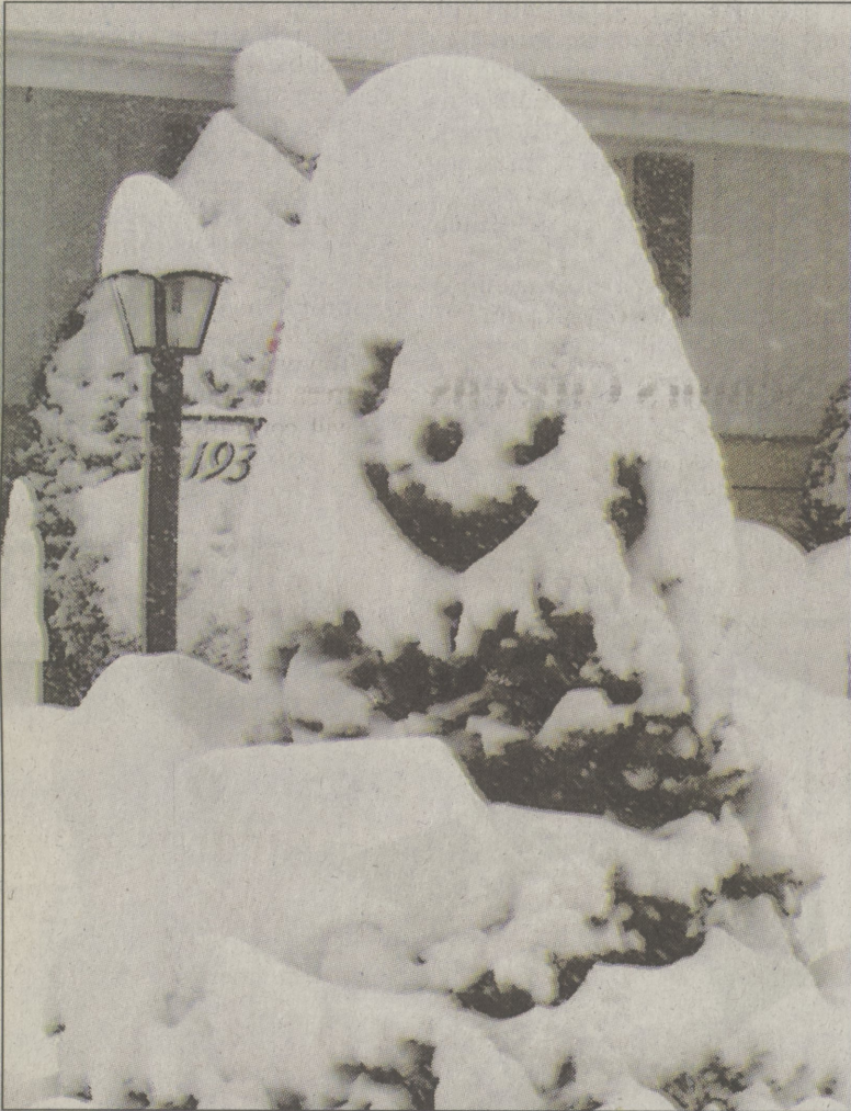
This shrub in front of 193 Woodbine Road in Shavertown seemed happy with the situation.