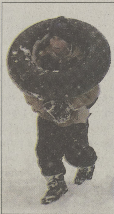
A sledder treks back up the hill at Center Street Park with his inner tube around his head after a run.