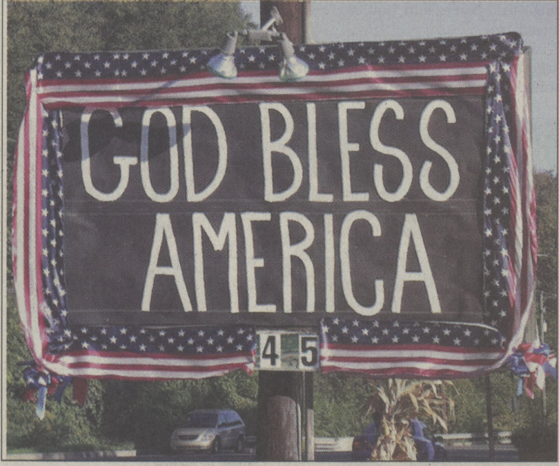
September 20: A sign in front of Rave's Garden Center in Shavertown expressed a common sentiment following the Sept. 11 terrorist attacks.

SPORTS - The Dallas Mountaineers won back the Old Shoe trophy, beating Lake-Lehman which will add a middle school 21-14. The victory was the