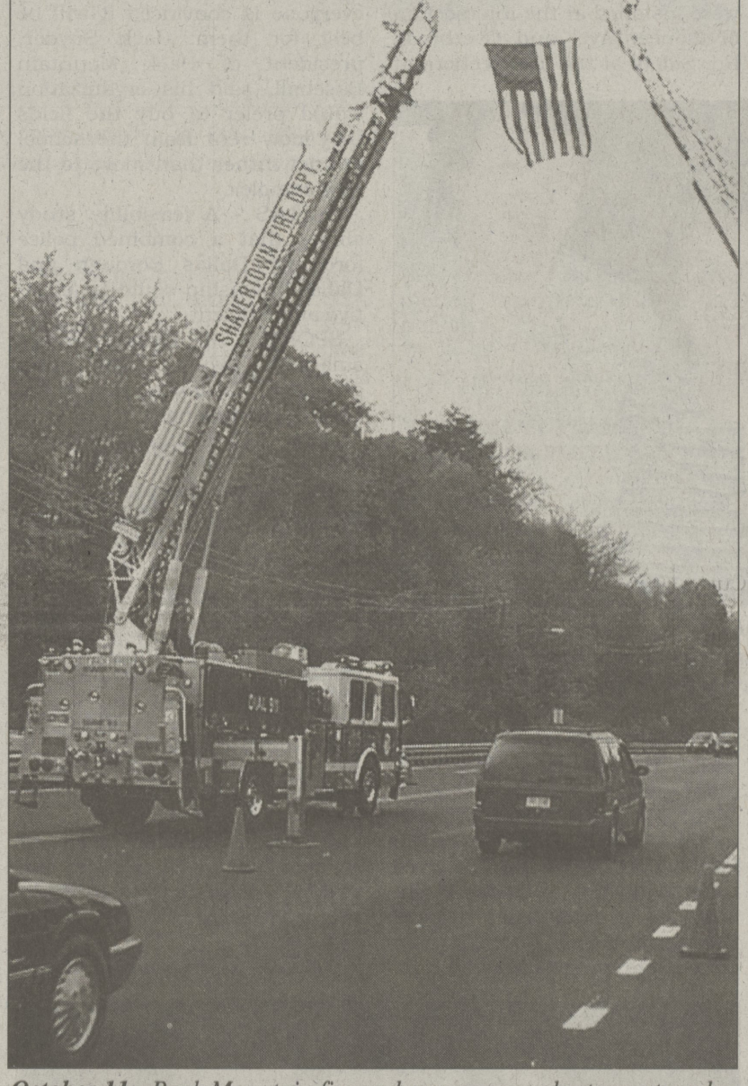
October 11: Back Mountain fire and emergency volunteers staged a tribute to their fallen comrades in the Sept. 11 attacks. Two ladder trucks formed an arch on Rt. 415 in Dallas.

TRUCKSVILLE - Filled with donations from the community, the Back Mountain Food Bank provided Thanksgiving food bas-