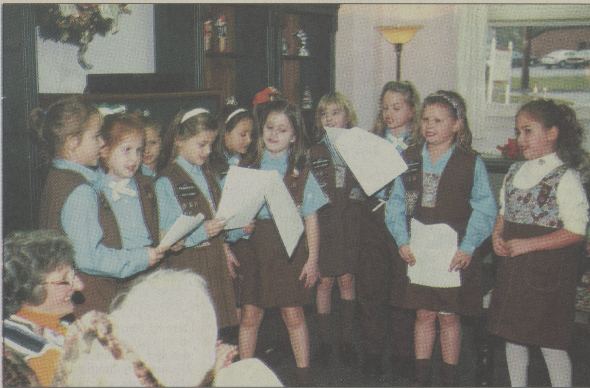
The children from Gate of Heaven Brownie Troop 631 sing traditional carols for the residents.