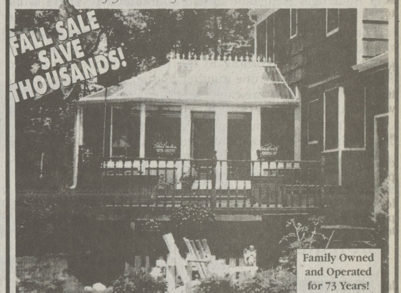
Family Owned and Operated for 73 Years!

INVEST IN YOUR HOME, INCREASE IT'S VALUE AND ENHANCE YOUR LIFESTYLE!