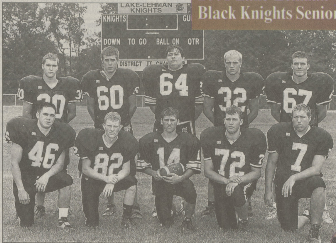
2001 Lake-Lehman Black Knights Seniors