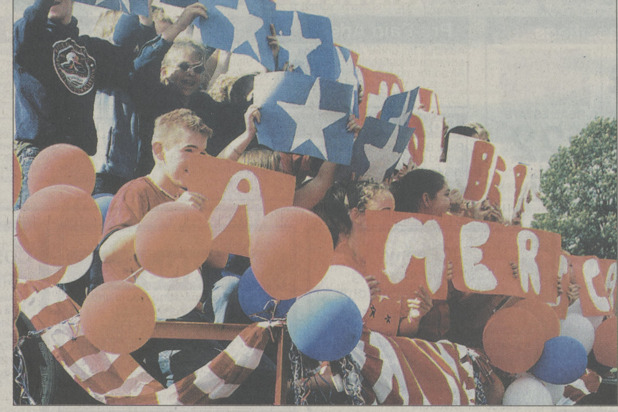
The Lake-Lehman freshman class float displayed the patriotism of more than 60 students.