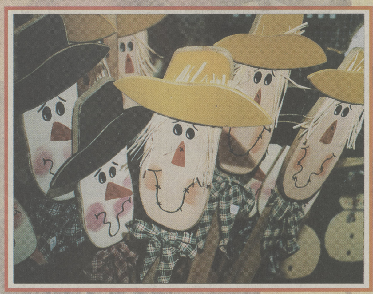
Who could resist these smiling faces?