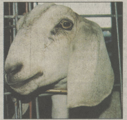
The chic new look for fall.