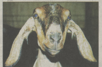
What, me worry?