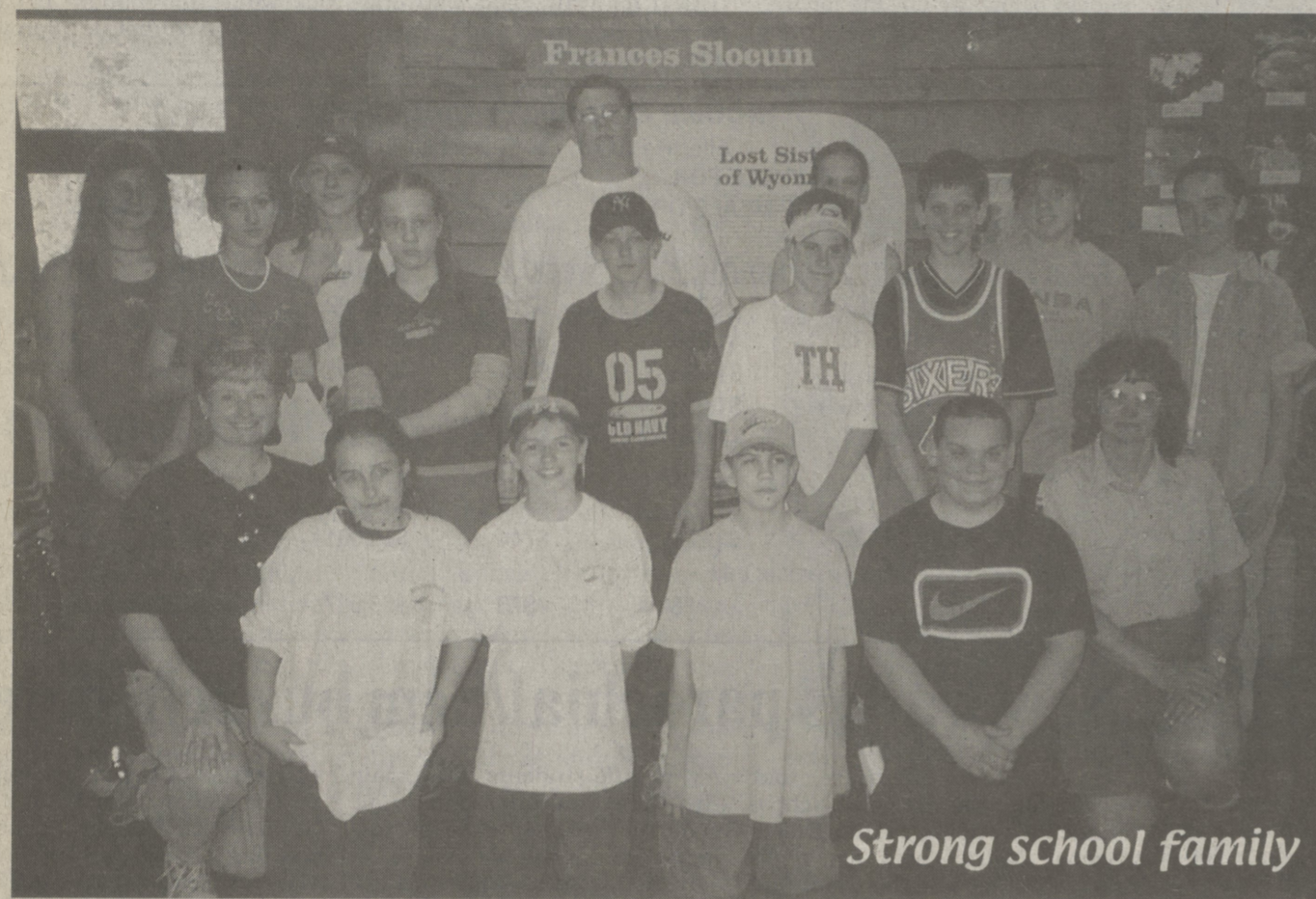
Strong school family