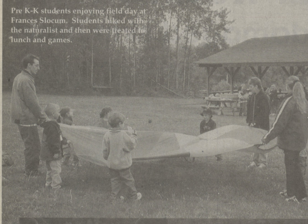
Pre K-K students enjoying field day at Frances Slocum. Students hiked with the naturalist and then were treated to lunch and games.