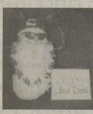
Pinatas created by St. Mary's Language Club. The club has 50 members and learns a new language each month. The students also visit ethnic groups, invite speakers and enjoy lunch at ethnic restaurants.