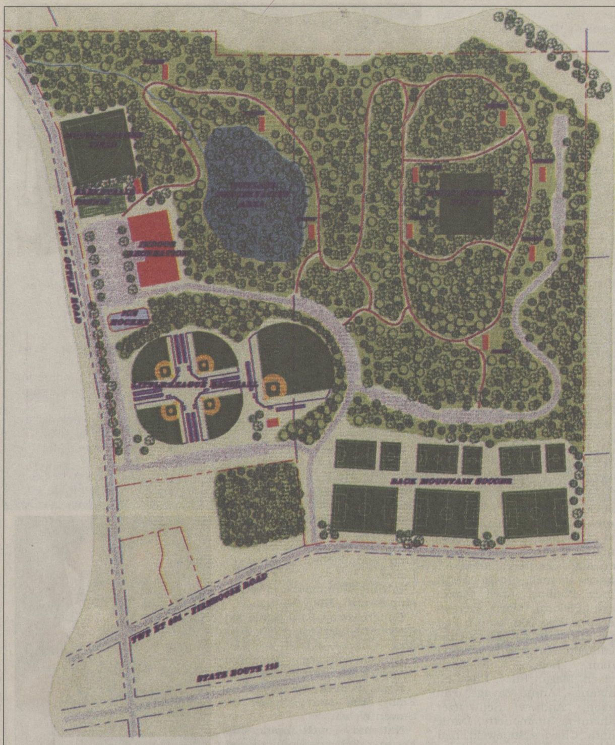
The conceptual plan for the Back Mountain Sports and Recreation Complex shows a set of Little League fields, center left, soccer fields, lower right, hiking trails, picnic areas and an indoor facility.