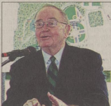
"This is a major league win for all of us in the Back Mountain."