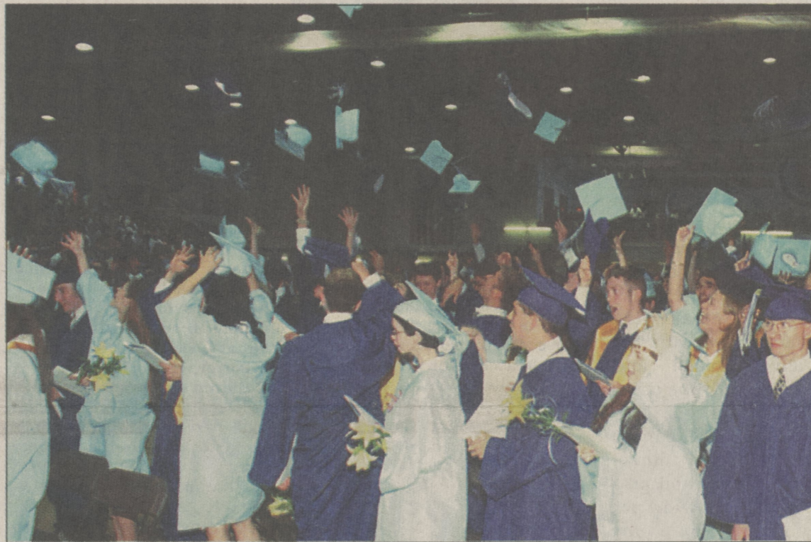
Caps went flying as the ceremony ended.