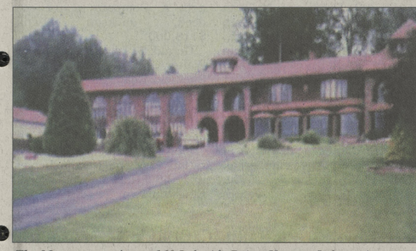
The Morrow mansion at 160 Lakeside Drive, Harveys Lake, as it appeared until last week, when it was demolished.