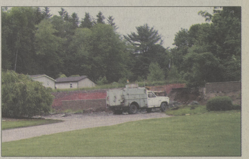
An empty lot was all that remained on Monday afternoon.

On April 30, a permit was is-Brdaric Excavating is named as The home, on approximately 1 the contractor for the demolition See HOUSE, pg 5