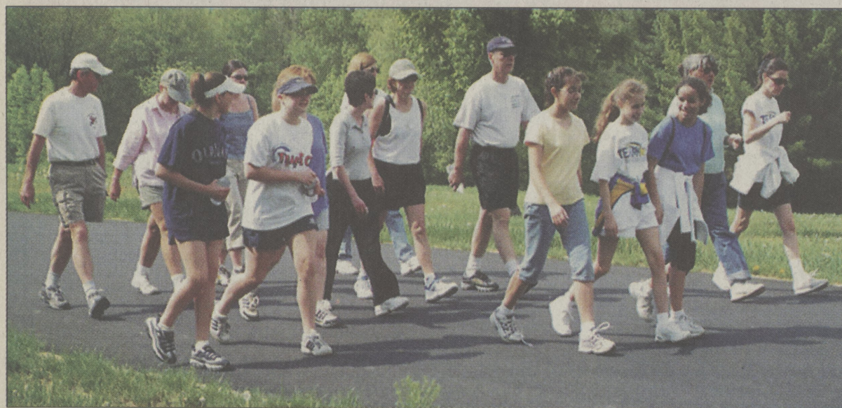
Local residents join tens of thousands of people across the country in the Great Strides: A Walk to Cure Cystic Fibrosis.