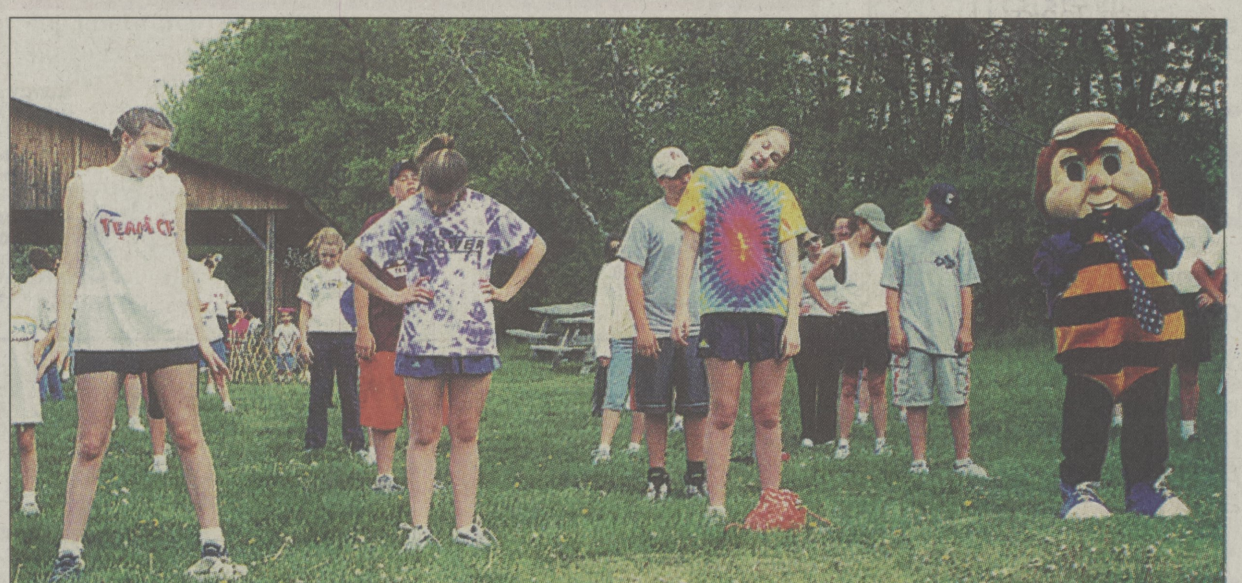
Walkers get a full work out at the Cystic Fibrosis Great Strides Walk.