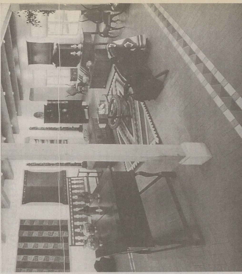
Natural materials, notably wood, leather and tile, are the essence of the Southwestern look.

Another group of quarry tiles are faithful reproductions of decorative designs created around the turn of the century by celebrated American studios, and their artists