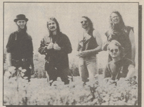
THE KENTUCKY HEADHUNTERS

8:30 pm - Cutter and the Doctor - playing the best in acoustic rock (Community Stage)