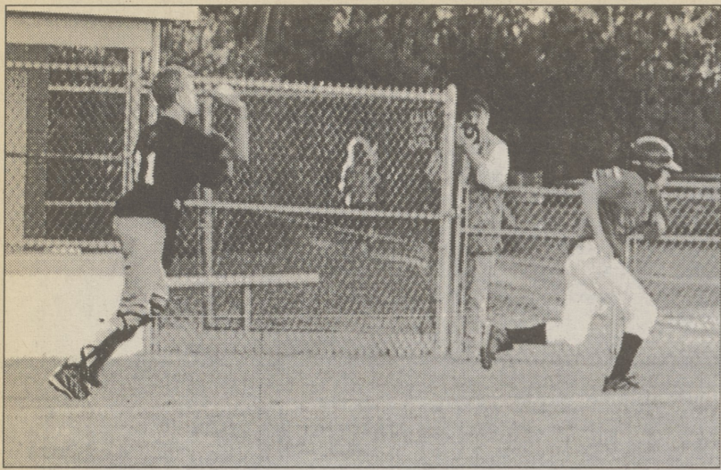
Rundown gone wrong. Back Mountain National players turned an out into a run Friday for Jenkins/Pittston/Pittston Twp. In the series