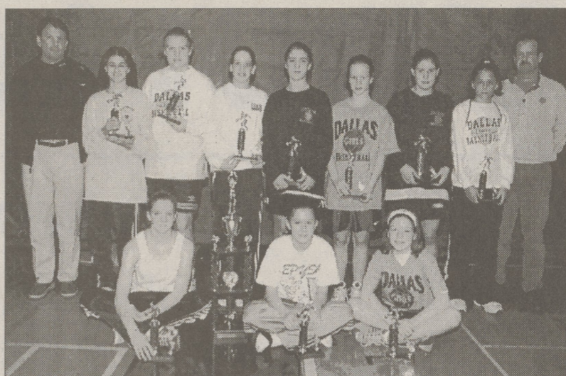
Dallas Youth Basketball, 2nd place team, 7th grade division.