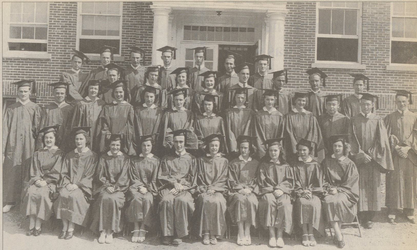
The Dallas Township High School Class of 1940 gathered in their caps and gowns for a group picture outside the school.

A tribute is paid to these, and other classmates who have passed, at every reunion. Plans