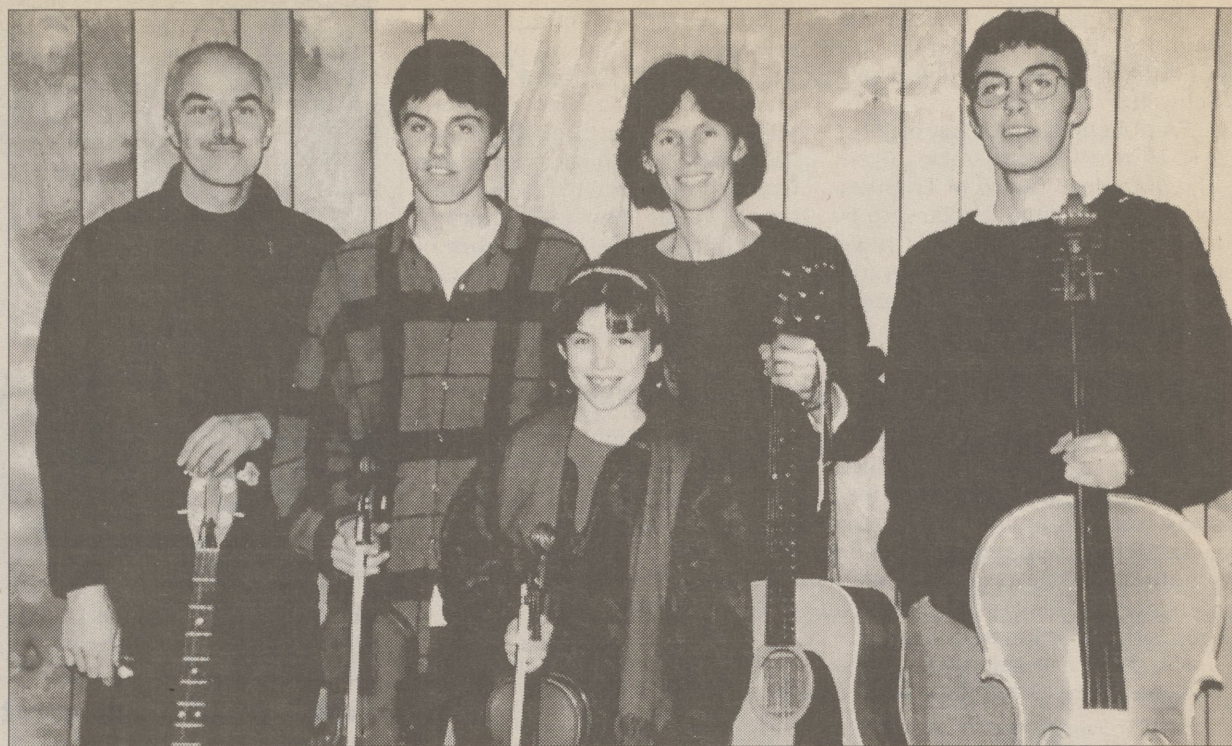
The Warrington family band will perform at the Chicory House Jan. 8.

Contra dancing probably began during the 1500's in English villages, but the name contra derived from the French "contre" (opposite) to reflect the long line of dancers facing each other. The dance form was preserved in New England and carried into the 20th century by Vermont dance caller Ralph Page. Contra dance figures are either choral or couple. Choral figures include moving the long lines simultaneously forward and back, or in groups of four in circles, stars, and heys (a figure eight pattern). Some of the couple figures include many common to