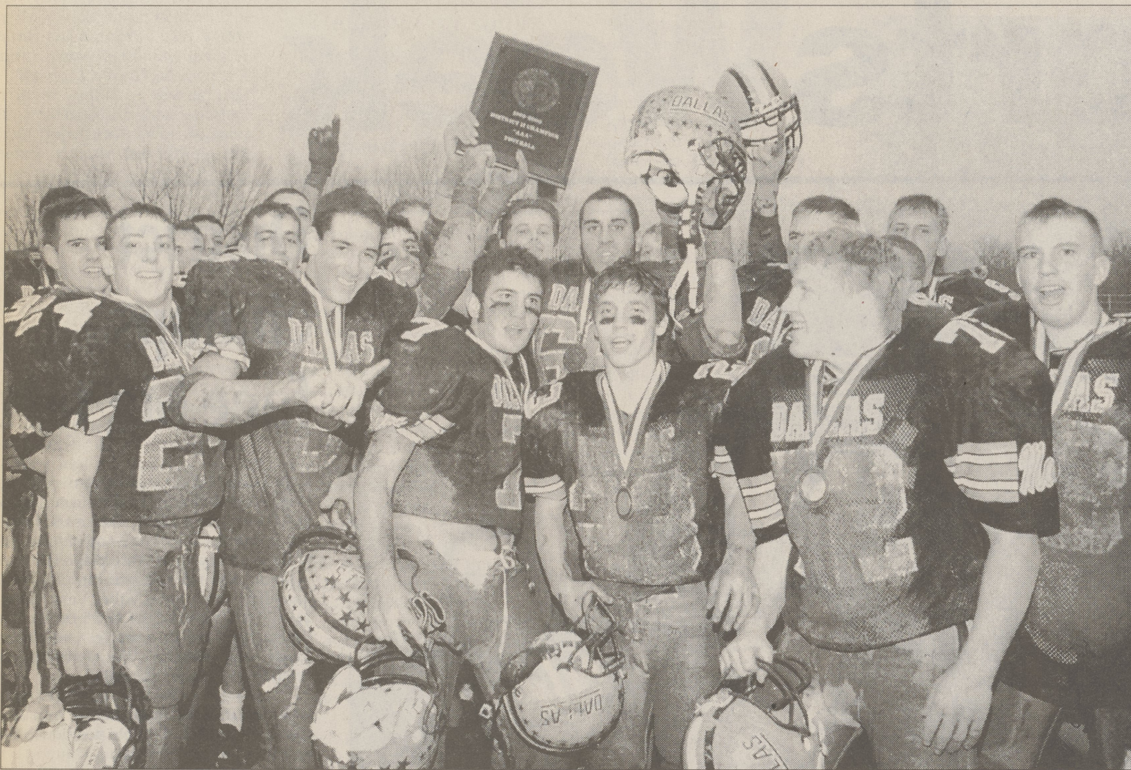
They're #1! Dallas players celebrated with the Class AAA district championship plaque.