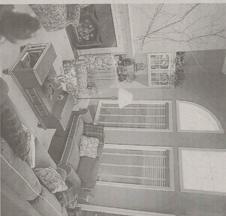
Adding beauty to any room is easy once people get over their initial anxiety toward painting.

On second thought, maybe a paint job is not the same as getting into shape. It's more fun, takes less time and the results are more lasting.