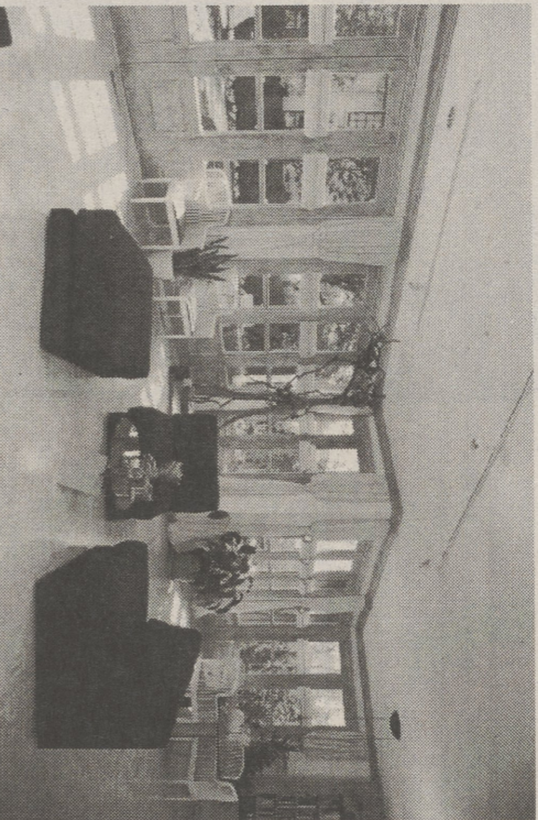
The arrangement of furniture and direction of light affect how you feel about a room.

One of the most important components of any window is its edge spacer, with which all double- and triple-pane windows are constructed to reduce heat loss around the window's edges. "It is important to note that the edge spacer material can mean the dif-