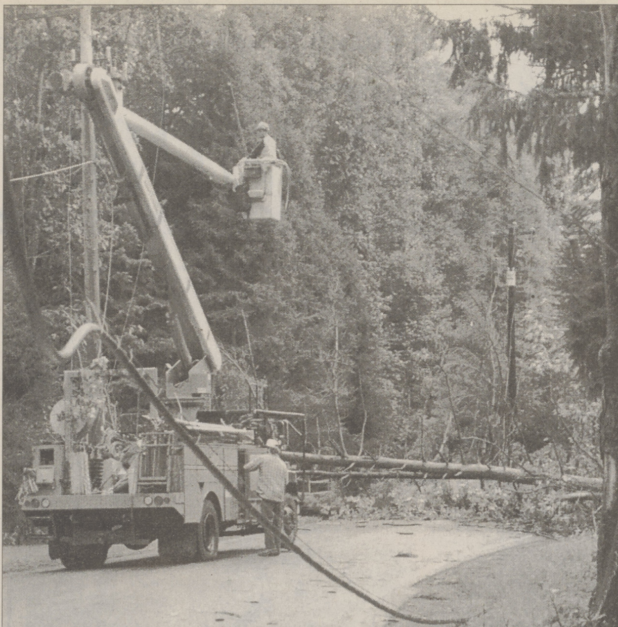
Downed trees closed Huntsville Rd. near the reservoir.

The outages, especially those lasting long after the storm moved through the area, caused serious problems for some