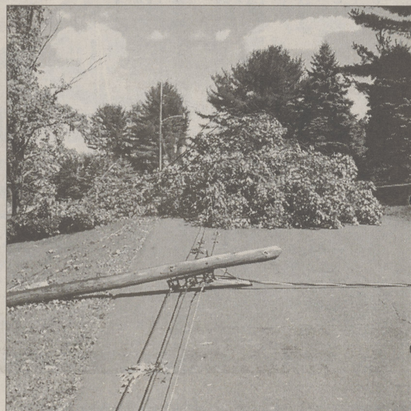
A tree took down a pole and wires on Wyoming Ave. in Dallas Borough. It wasn't removed until late Sunday.