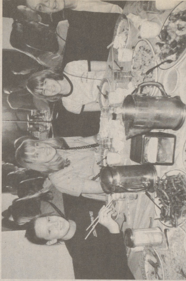
A rich variety of Chinese foods satisfied every taste at a Chinatown restaurant on a Cadette/Senior trip to New York in April. Greenwich Village, Little Italy, Chinatown, the Staten Island Ferry, Rockefeller Center were a few of the sites girls visited.