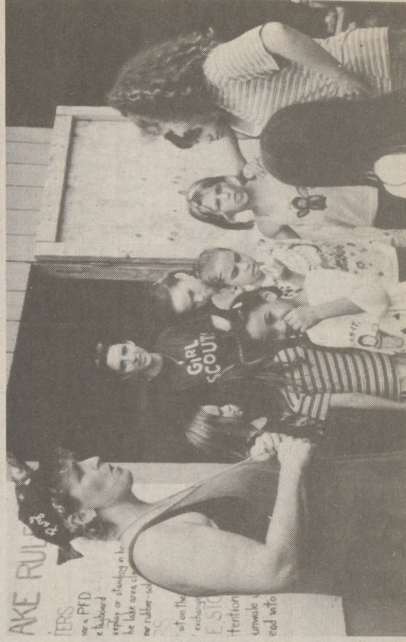
These first-time boaters (and campers) from Hazleton, Exeter and Wilkes-Barre get a few tips on water safety as they prepare to launch their rowboats on Sunset Lake at Camp Louise.