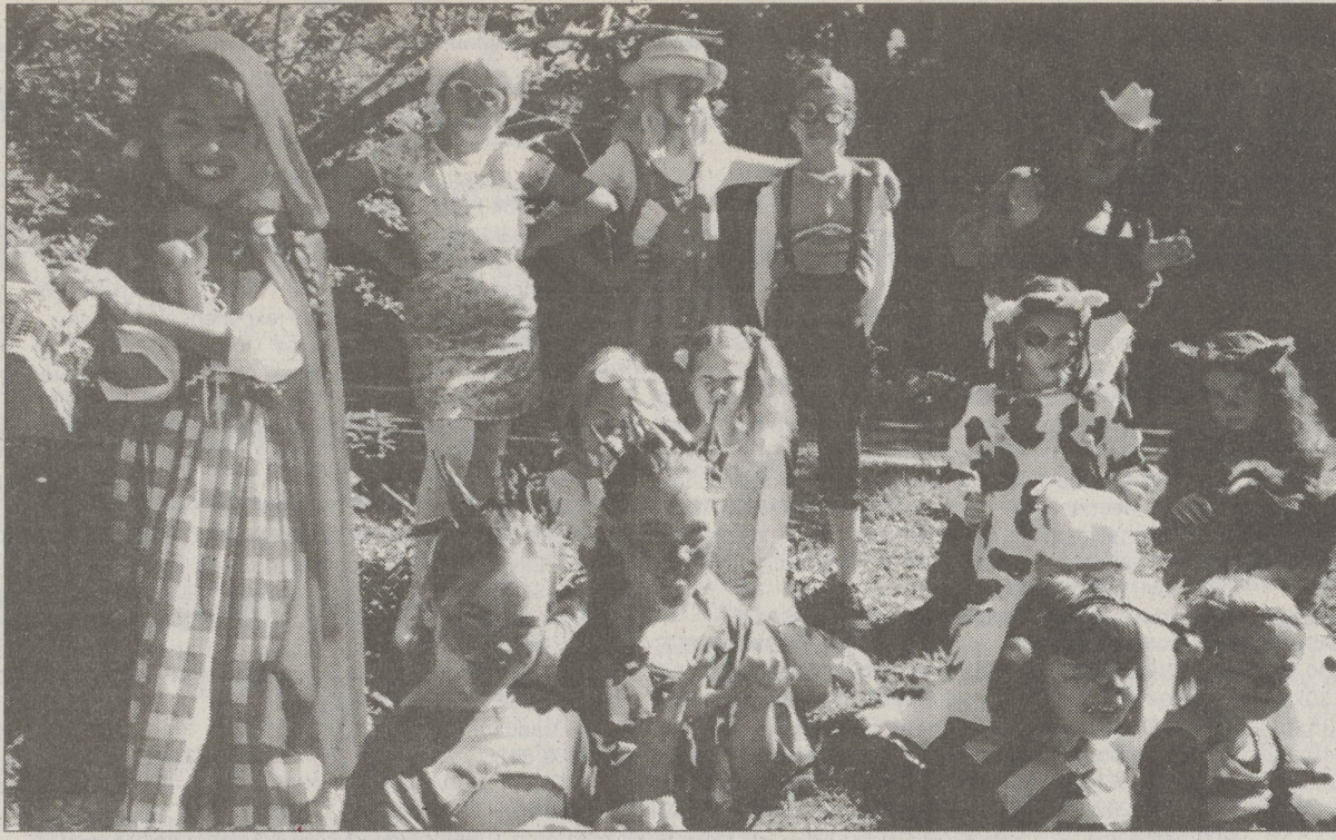
"The Three Little Pigs... go west!"