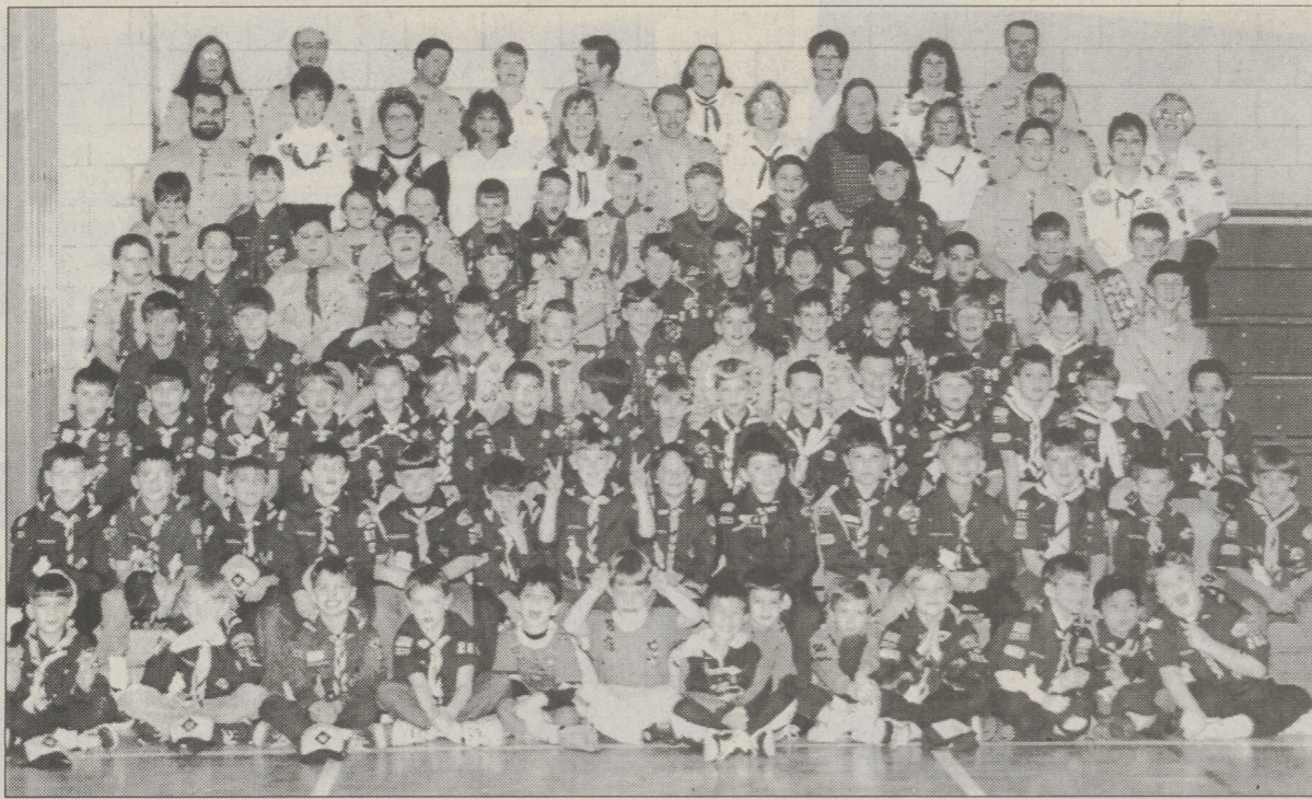
Cub Scout Pack 281 and den leaders gather for annual celebration and awards presentation.

Support a Hometown Paper The Dallas Post