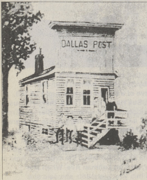
1889 - The Dallas Post opens at the corner of Huntsville Rd. and Norton Ave.

Your items are always welcome at The Dallas Post. You can drop them off at our office at 607 Main Rd., Dallas, Monday through Friday 8:30 a.m. to 5 p.m. If you can't make it then, a locked night deposit box is at the front of the office. You can also fax items to (570) 675-3650, or send them by e-mail to dalpost@aol.com