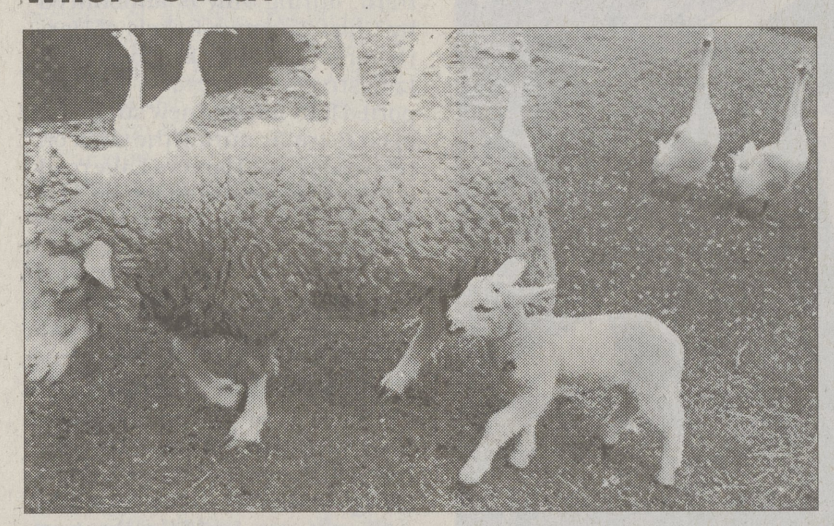
She's getting away