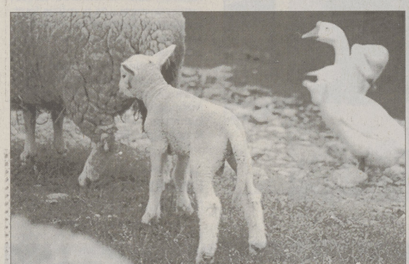
Now I've got her