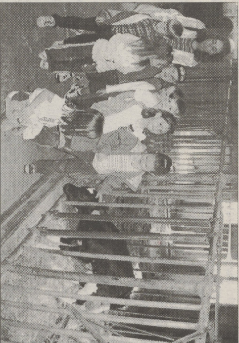
Pre-school students from St. Mary's in Wilkes-Barre got acquainted with a spring calf at Hillside Farm.