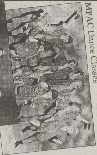
MPAC Dance Classes

"Successful Performing Arts Programs for the Whole Family!" DANCE • THEATRE • VOICE • PIANO PRE-SCHOOL PROGRAMS