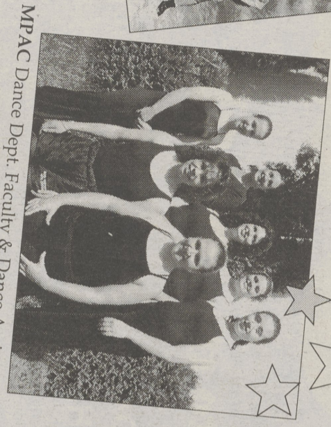
MPAC Dance Dept. Faculty & Dance Assistants