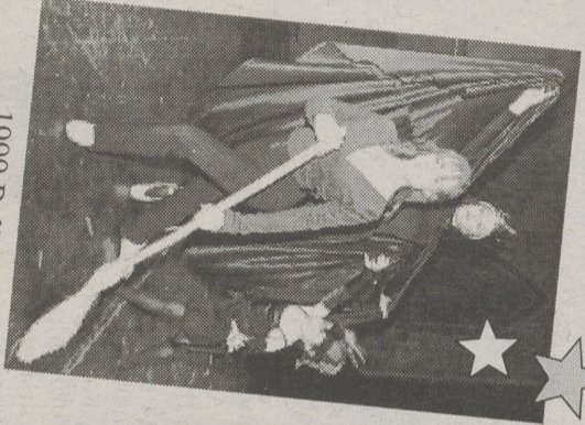
1999 Ballet Production "Sleeping Beauty"

MPAC FEATURES: • Dance Dept. 7 Award Winning, Certified, Senior Instructors, plus Dance Assts. • BALLET-TAP-JAZZ-POINTE • Music Dept. PRO-VOCAL and PIANO • Theatre Dept. Childrens Theatre Classes, In-House Childrens Theatre Touring Co., and "home" to NE PLAYERS