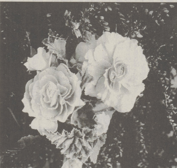
Lush, velvety begonia light up the shade with colorful flowers in the yummiest hues of rose, red, pink, apricot, orange, white and bi-colors.

Begonias are available as tubers in early spring and as bedding plants in late spring through summer. In most parts of the country, plants grown from tubers, as well as plants that have been lifted and stored over winter, should be started indoors. They should be planted out into the garden after the threat of frost has past. They will flower 12 to 15 weeks from start-up.