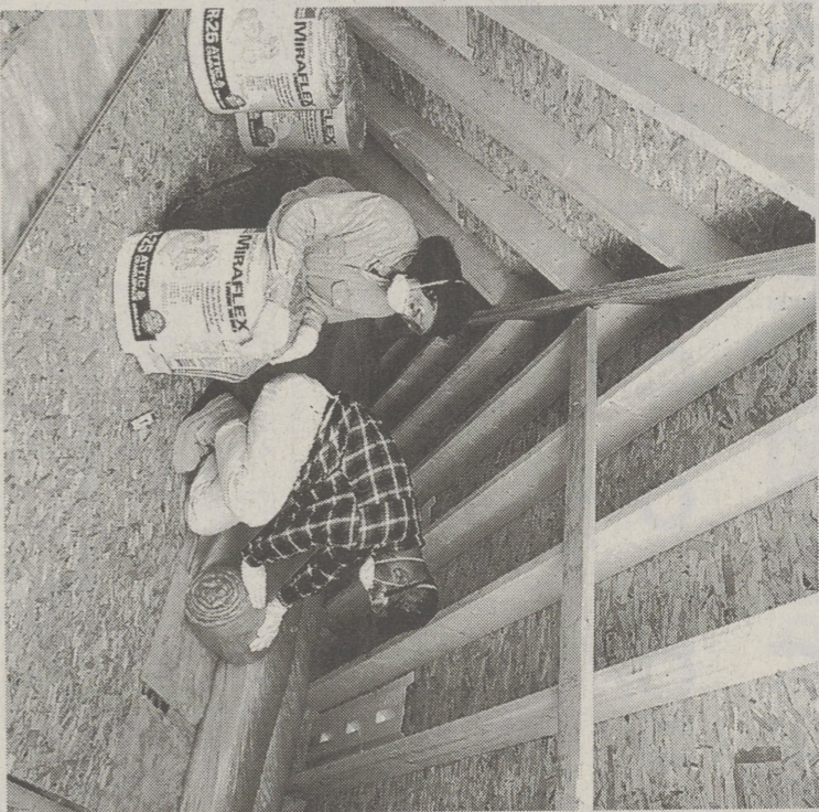
Insulation is just as important in the summer as it is in the winter. On warm days, outside heat attempts to move indoors, but insulation slows its transfer. New products on the market, such as Owens Corning's Miraflex insulation, make the job easier for a do-it-yourselfer.

(equivalent to 15 inches of fiber glass) in the attics of most new U.S. homes. Because most homes only have about 6 inches of attic insulation, the majority of homeowners may benefit by adding insulation in their attics. In fact, a recent study found that only 20 percent of the homes built before 1980 have adequate insulation in the attic. Insulating the attic is also one of the easiest and most cost-effective projects for a homeowner. Today, products are available that make insulating even easier for the do-it-yourselfer, including Miraflex® R-25 insulation (8" inches), a virtually rich-free insulation product manufactured by building materials systems leader Owens Corning. Before adding insulation to an attic, properly caulk or seal all cracks or openings in the ceiling. It also is recommended that homeowners install attic vents, which help prevent moisture buildup.