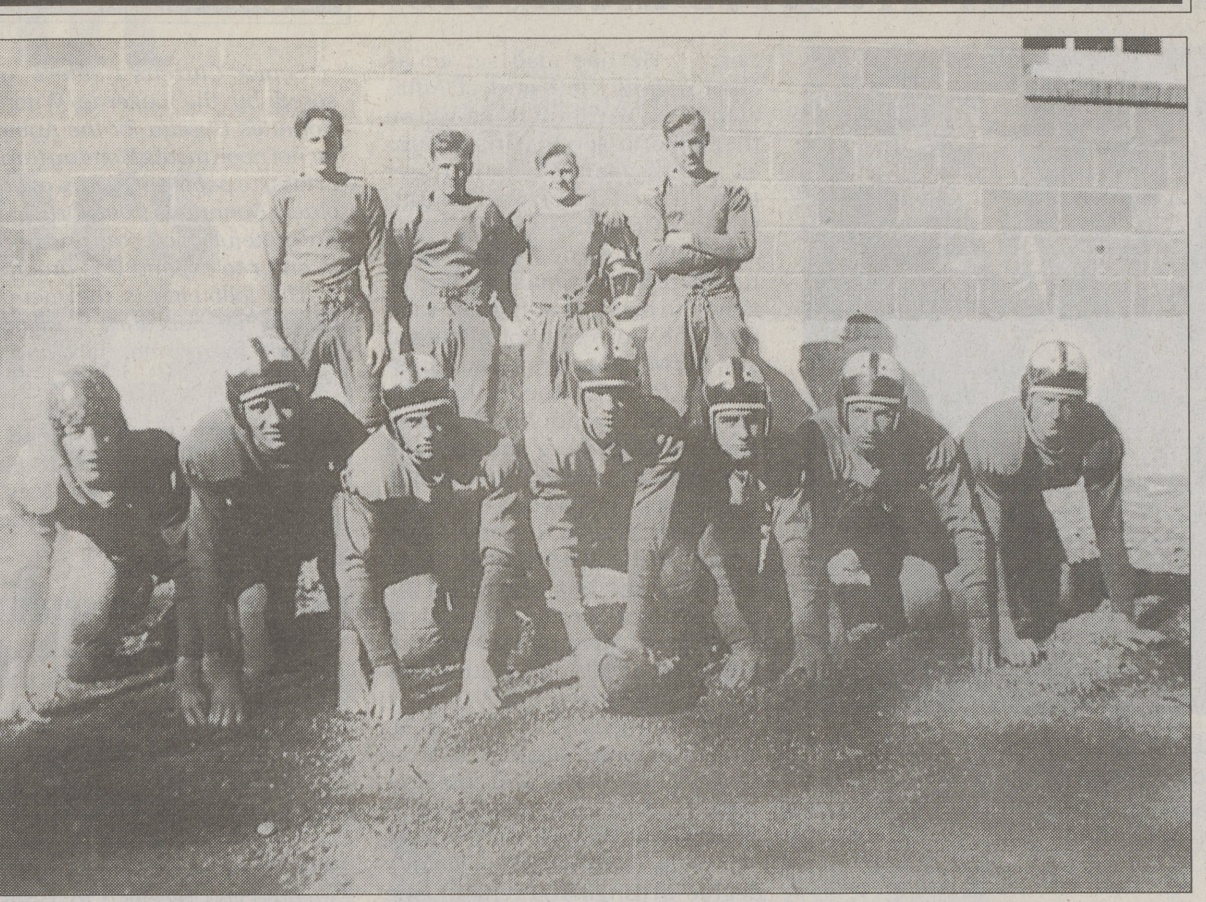
Editor's Note: The photo was marked as the 1936 team when it was first provided to The Dallas Post. Due to an editing error, it was changed to 1939 when it was published with names in the Jan. 13 issue.

The photo is almost certainly of the 1935 team (although there is some very remote possibility that it could be of the 1934 team). I know that it is not of the 1936 team, for I was starting center at the beginning of the season (a position from which I had to be removed because of my inability to center the ball with any degree of accuracy) and a starting tackle for the entire balance of that season, and I do not appear in the photo. I was on the team prior to the start of the 1935 season, but