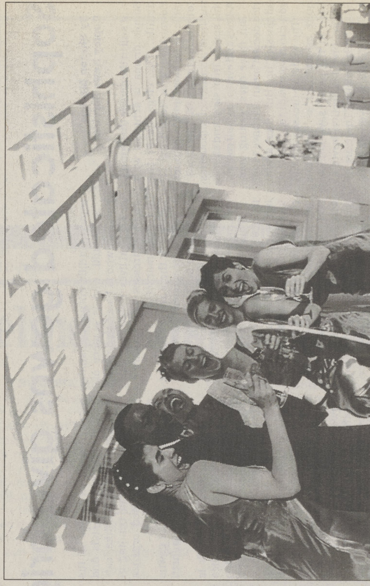
The simple elegance of these Odessa empire-waist gowns in polished pewter is enough to make any bridesmaid celebrate.

Soft pink is another favorite hue this spring for the bridal party. Softened up with chiffon, Jim Hjelm's Occasions pink