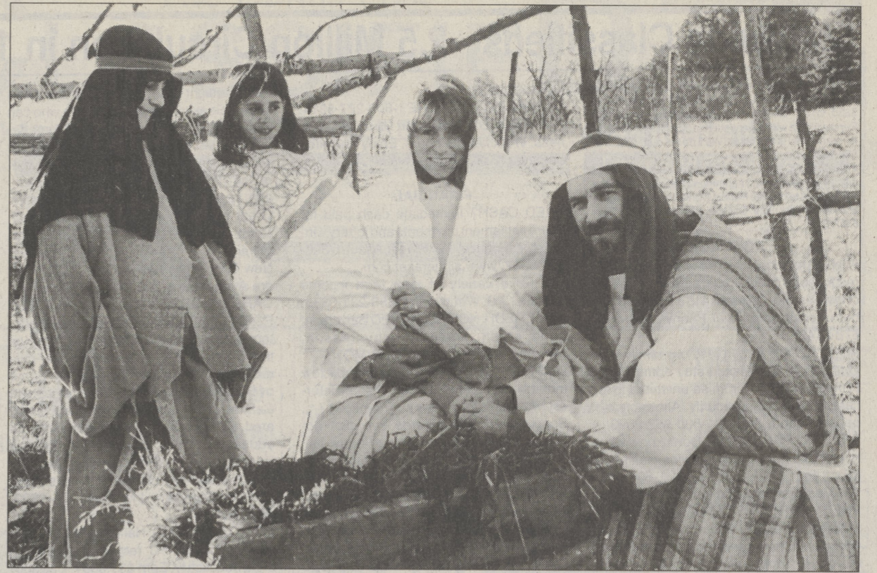
"The Gift" will offer three shows this weekend.

Performances will begin at 7 p.m. each night, Friday, Dec. 18 through Sunday, Dec. 20, with seating on a first-come basis. Expanded parking and shuttles will be available at the church grounds - 340 Carverton Road, Trucksville, just 1/4 mile off route 309 past Pizza Perfect. Bleacher seating will again be available. New light towers and a larger