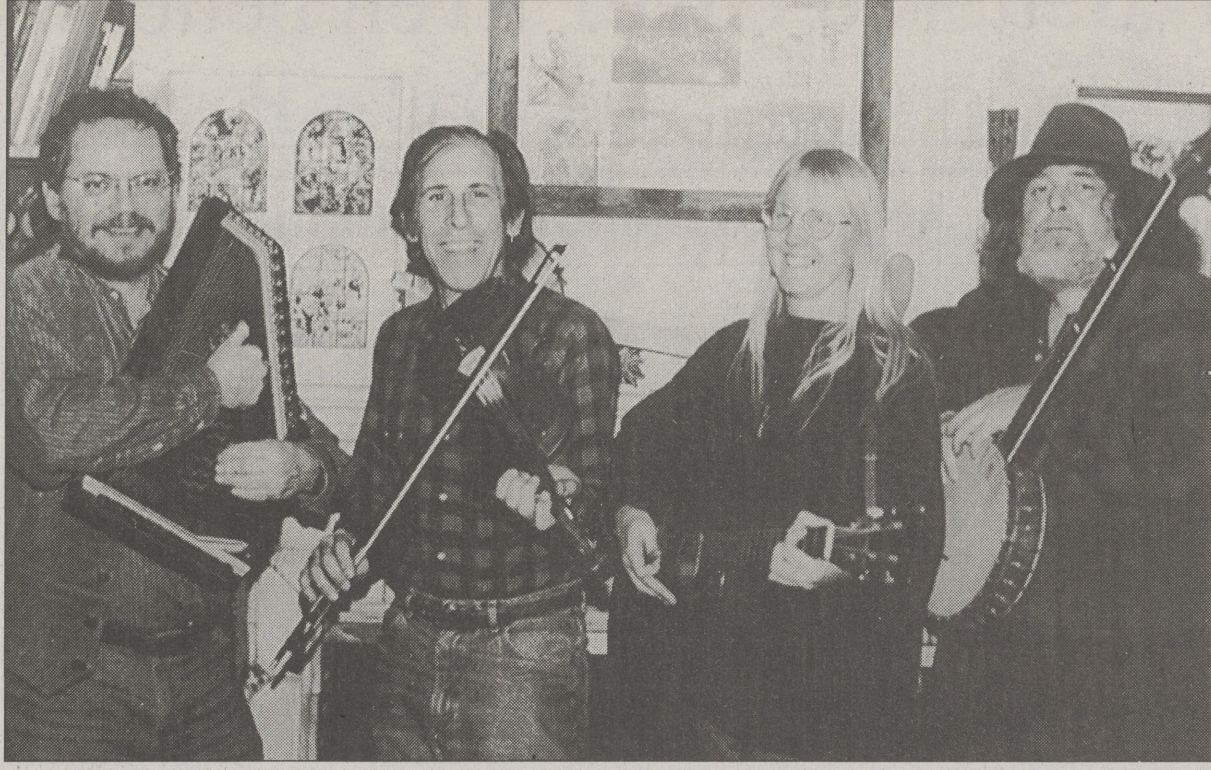
"Hobo Pie" will appear at the Chicory House dance Nov. 14

NOV. 21, HOLIDAY HOUSE TOUR , four Abington homes decorated in holiday splendor. 11 a.m.-4 p.m. House Tours and Artisans' Marketplace, $16 per person. Advance tickets Comm Office. For more info, 586-8191.