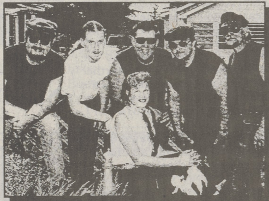
THE GREAT PRETENDERS