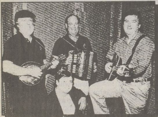
THE IRISH LADS