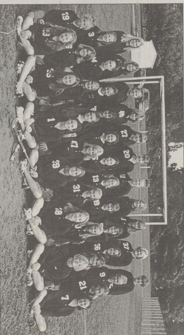
Lake-Lehman field hockey

The team's other strength is its physical conditioning. "We work very hard on conditioning,"