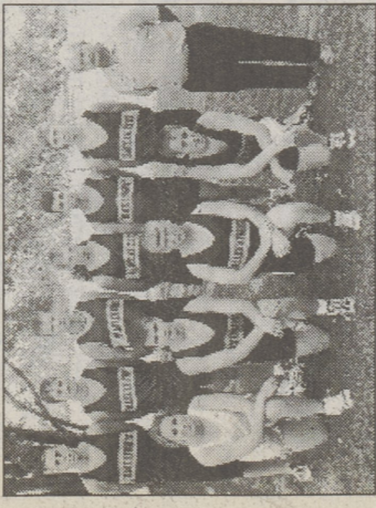
Lehman Cross Country