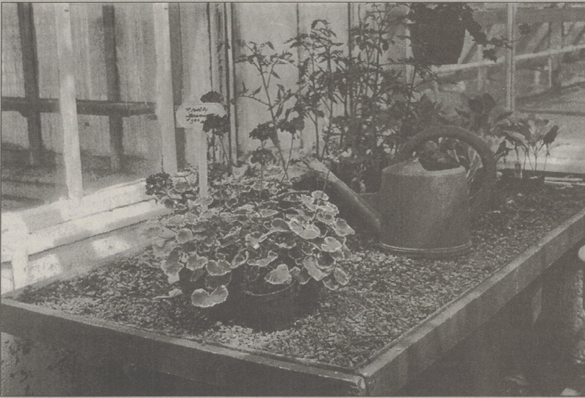
Enjoy it while you can. Summer is almost over and classes will resume on September 1 for both the Lake-Lehman and Dallas school districts.