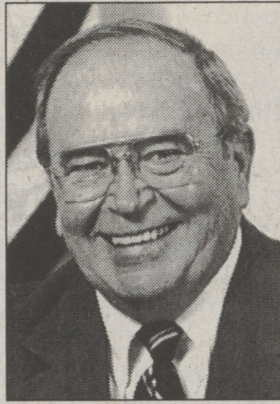
SENATOR CHARLES D. LEMMOND

The setting offers an informal forum for candidates, committee persons and the general public to meet and speak with each other.