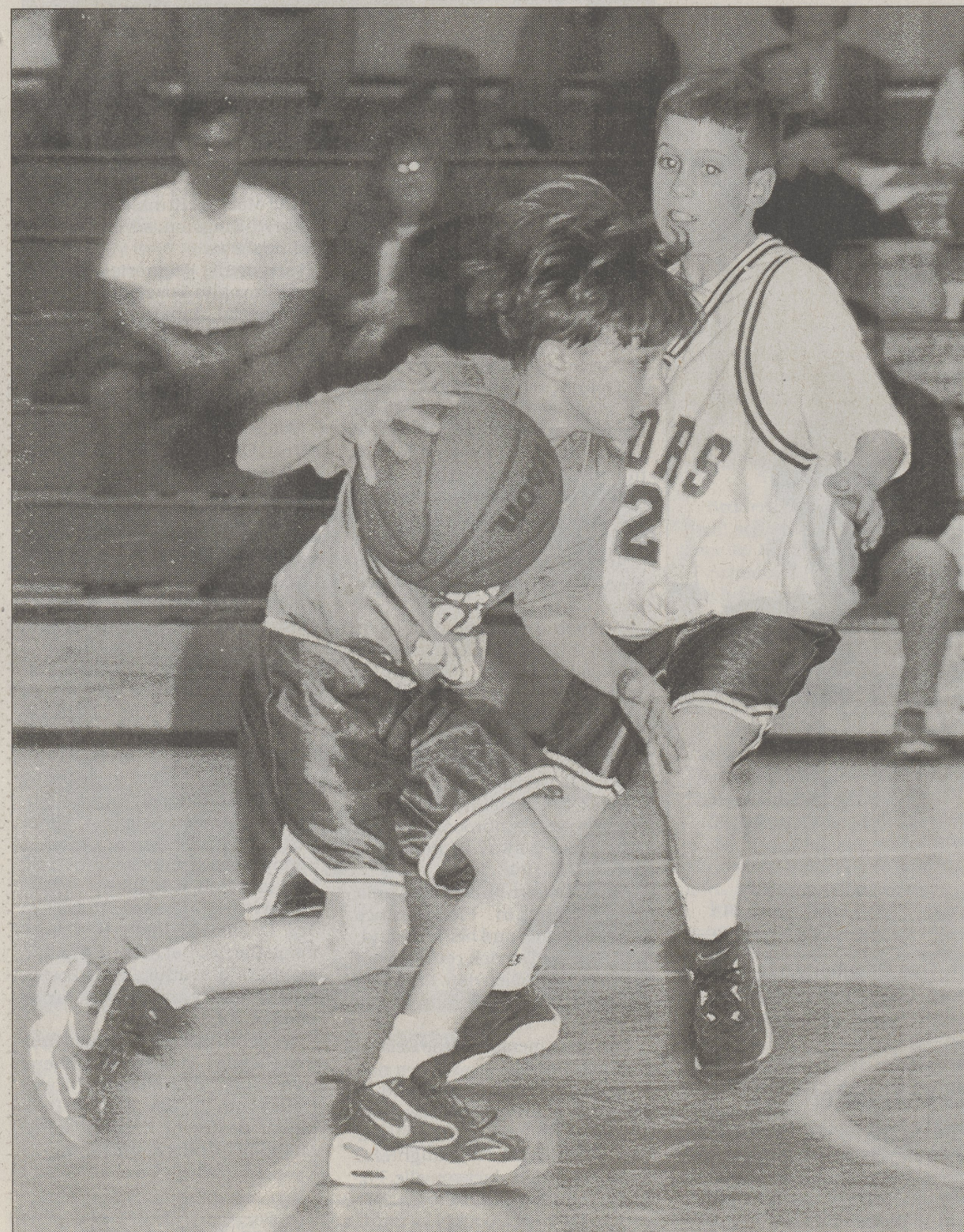
GOH on both sides. Gate of Heaven's 5th grade Green and White teams met Sunday afternoon in the Dallas Youth Basketball grade 5-6 tournament. Both teams came into the game unbeaten, but the Green team was the only undefeated